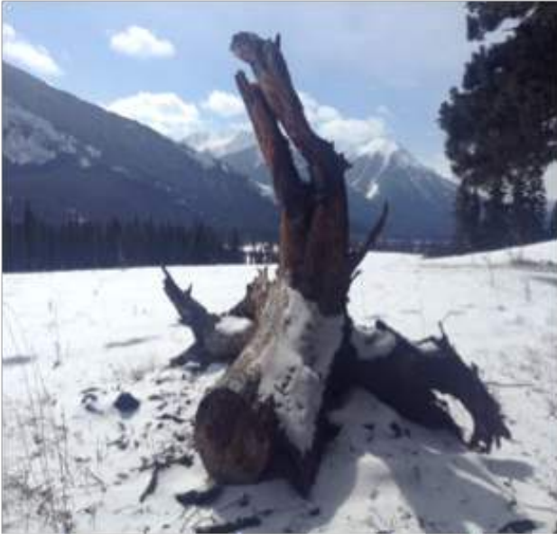
Dead stump for native bees