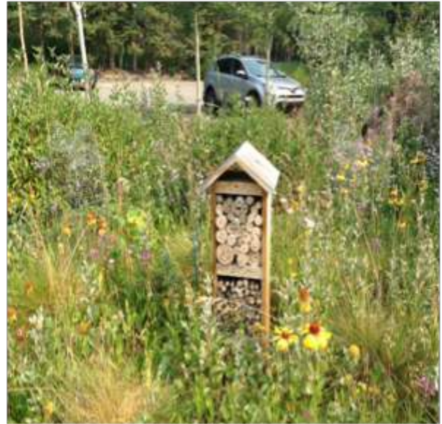
Folk art bee house